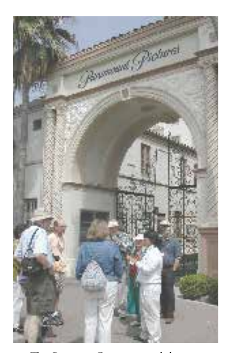
The Bronson Gate swarmed by eager conventioneers