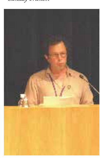
Curtis Armstrong, our Genuine Hollywood Actor, stirs the crowd.