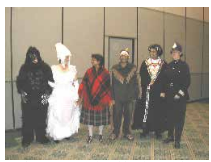
The NEWTS Extras take their well deserved photo call after their production "Penny's from Hades."