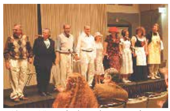
The NEWTS stars after their Friday evening performance