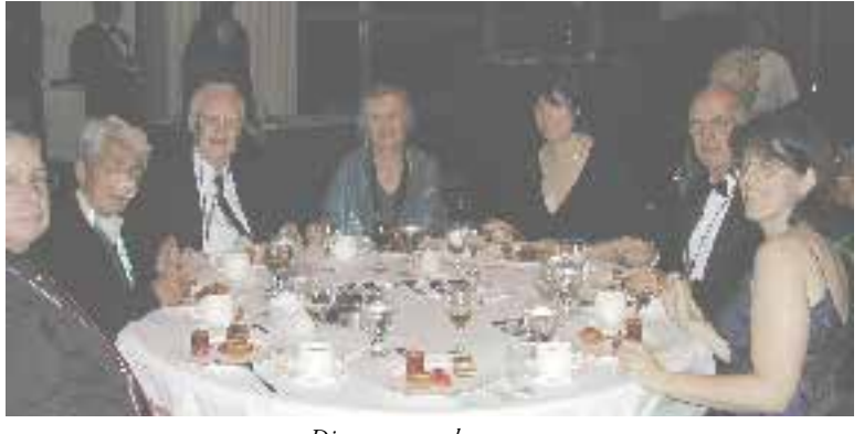
Dinner proceeds apace