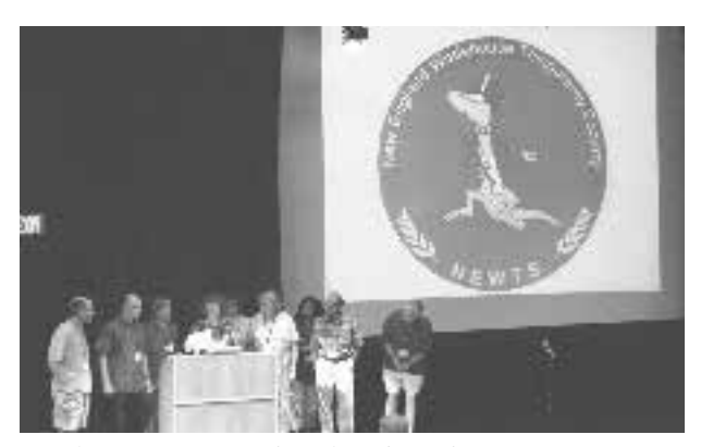
The NEWTS present their plot to bring the convention to Providence in 2007, and the L.A. conventioneers gladly accept!

The Newport Mansions: www.newportmansions.org