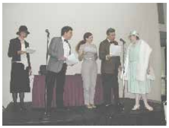
The Perfecto-Zizzbaum skit sizzles at the Sunday brunch.