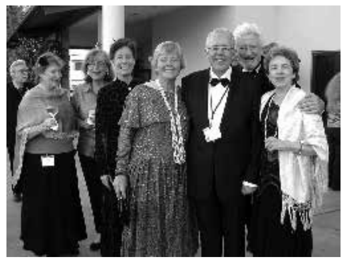
Smiling faces, new and renewed frienships, and a touch of the regal at the TWS 2005 convention in L.A.

On Friday morning convention goers piled into a couple of buses for a tour of Hollywood. On our bus the tour guide was actor, writer, and convention