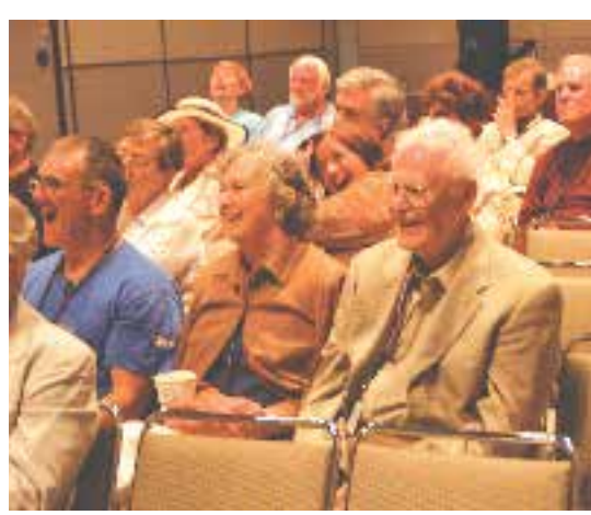
Clean, Bright Enjoyment