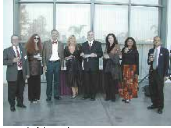
A gaggle of Plummies forms pre-reception