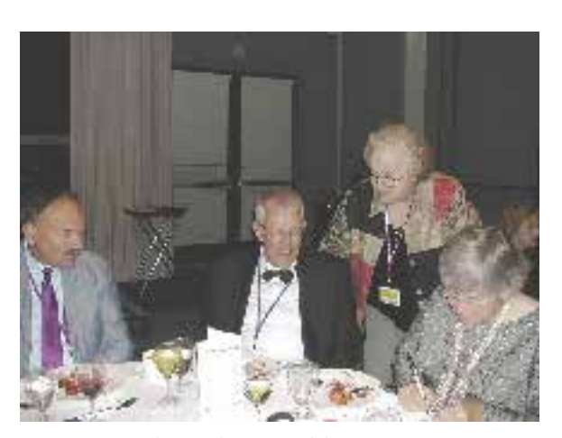
The ritual "signing of the menus"