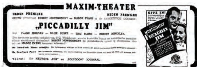
One of the several movies shown at the inaugural Wodehouse Film Festival in Amsterdam.

The next regular meeting of the Knights will be on June 16, 2018, at 1 PM, in Restaurant Szmulewicz, Bakkerstraat 12 (off Rembrandtplein) in Amsterdam.